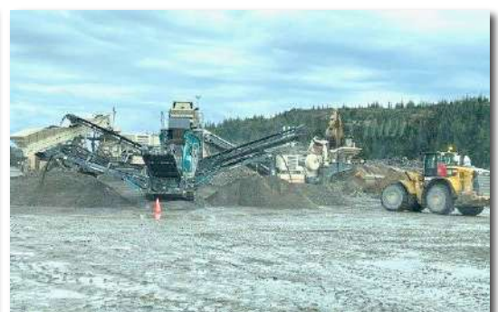
TSI staff are involved in a range of activities at the Vale site, including port and stone crushing operations.