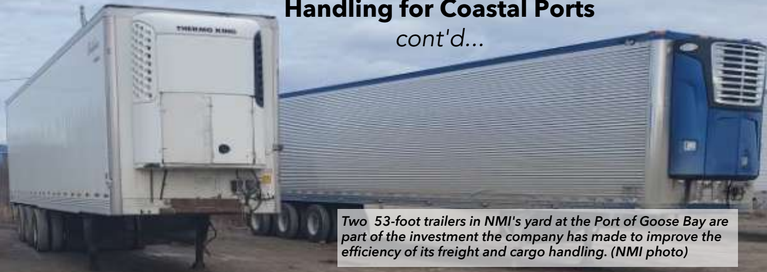
Two 53-foot trailers in NMI's yard at the Port of Goose Bay are part of the investment the company has made to improve the efficiency of its freight and cargo handling.

"We purchased two 53-foot trailers," says Latimer. "One is for dry shipments like packaged food and beverages and the other is a reefer to carry chilled and frozen products. A 53-foot trailer allows us to make maximum use of the deck space on the ship. The trailer actually takes up the same deck space as two 20-foot containers and it can hold more cargo. That improves efficiency both in clearing up freight in the terminal and in loading and unloading."