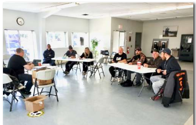
Safety is practiced in all aspects of the job. At left, NCI employees complete work on a project for a private company in Happy Valley-Goose Bay. At right, NMI employees undergo safety training.