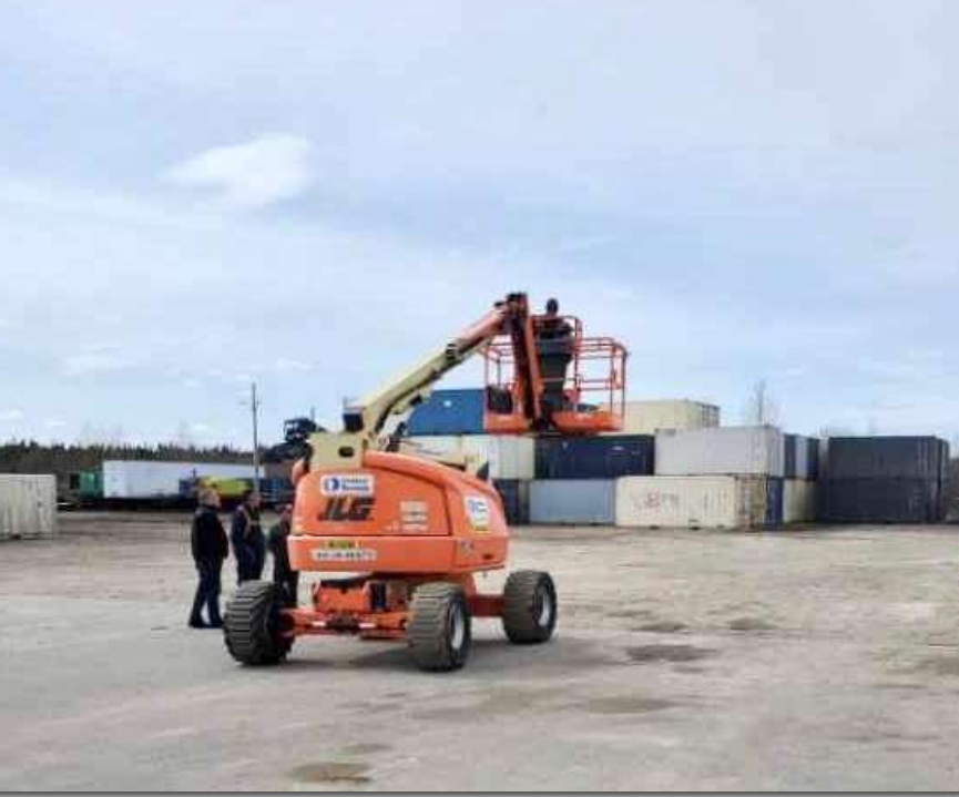
Nunatsiavut Marine Inc. staff train on a telescopic boom lift at the freight yard in Goose Bay. The lift is used to keep employees safe while completing overhead jobs.

Spring is a busy season for the Nunatsiavut Group of Companies. NCI is gearing up for a busy construction program, NMI crews are hired back for the coastal shipping season, and NSI and Air Borealis are making preparations to welcome guests back to Base Camp at Torngat Mountains National Park.