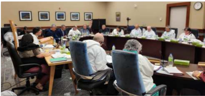
The annual presentation to the Assembly is a major event in our commitment to transparency.

Our appearance at the Assembly is not just an occasion to spread our good news. It's also a chance for members to ask questions. And there were lots of them.