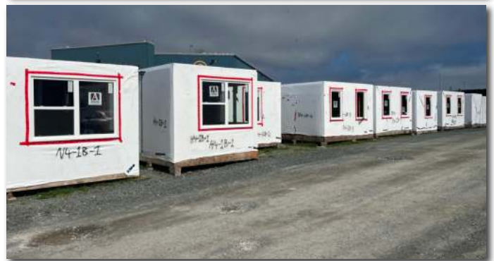
Top, prepared site for seniors' apartments in Nain. Below, completed apartment units ready to be shipped.