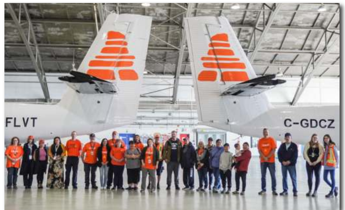
Air Borealis leaders and staff join Indigenous community representatives for unveiling of the re-decaled tail section of two aircraft.

Air Borealis is honouring the victims and survivors of Canada's residential schools by outfitting two aircraft with orange Air Borealis decals, the colour that has become the symbol for the National Day. The decals were installed on September 15 and will remain in place until October 15.