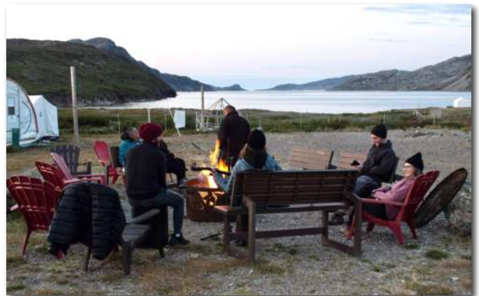
Guests at Base Camp were treated to a full range of entertainment, including Inuit traditional dance and story, and contemporary music.

allowed us to get guests in and out on time, with only one two-day interruption. We got the support crew out of Camp two days after the last guests left. Thanks to everyone, this was a very successful season."