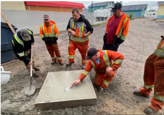
The vehicle manufacturer in the U.S. sent a trainer to Happy Valley-Goose Bay to provide training for the crew that will operate the truck.